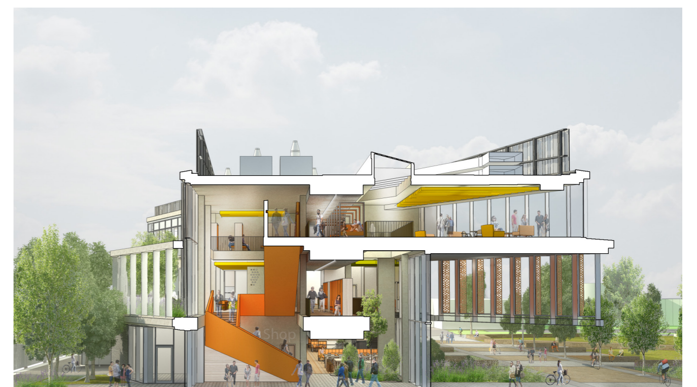
A section through the main entrance and atrium in the new building