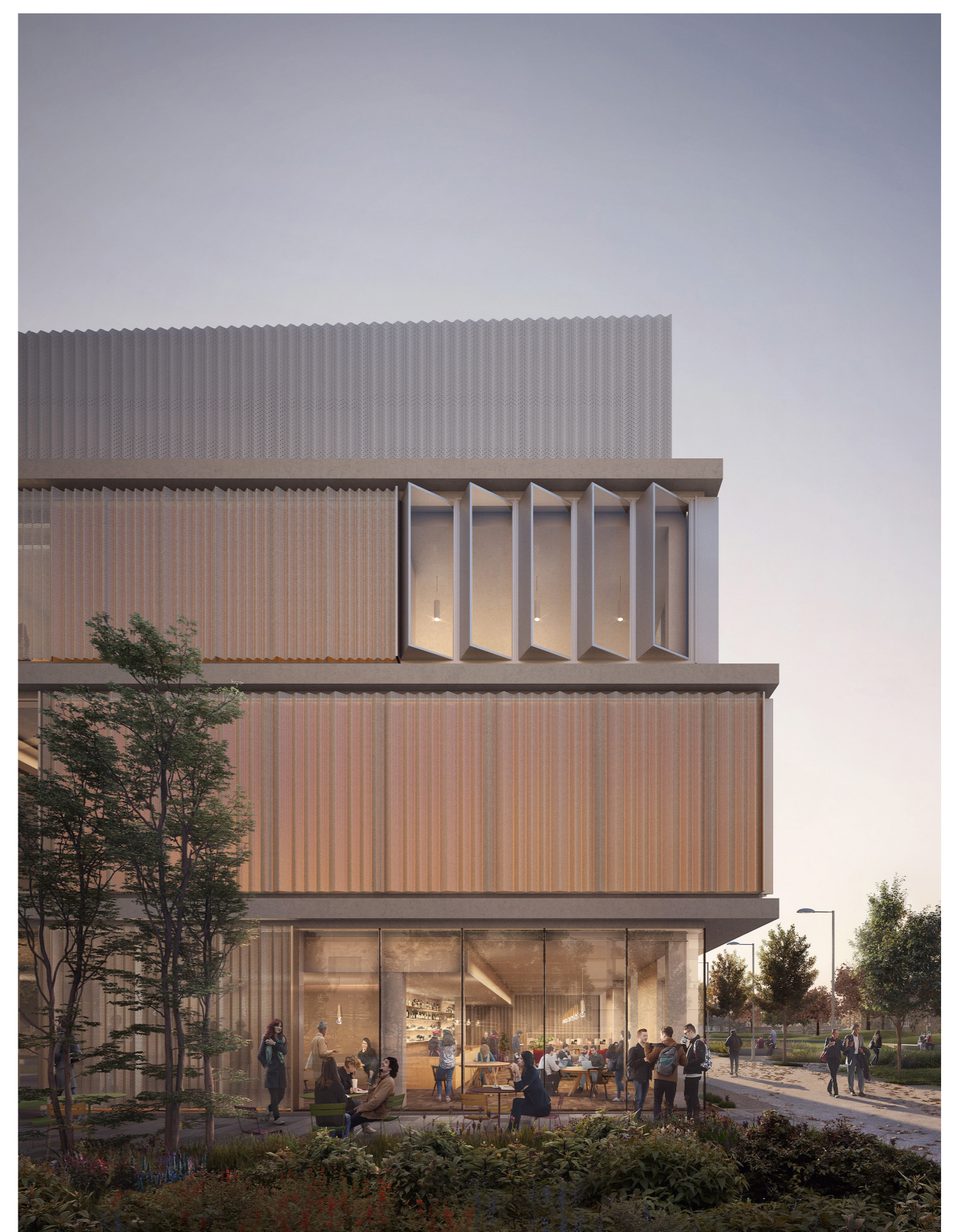
Visual of the new cafe bar at the corner of J.J. Thomson Avenue and the new park