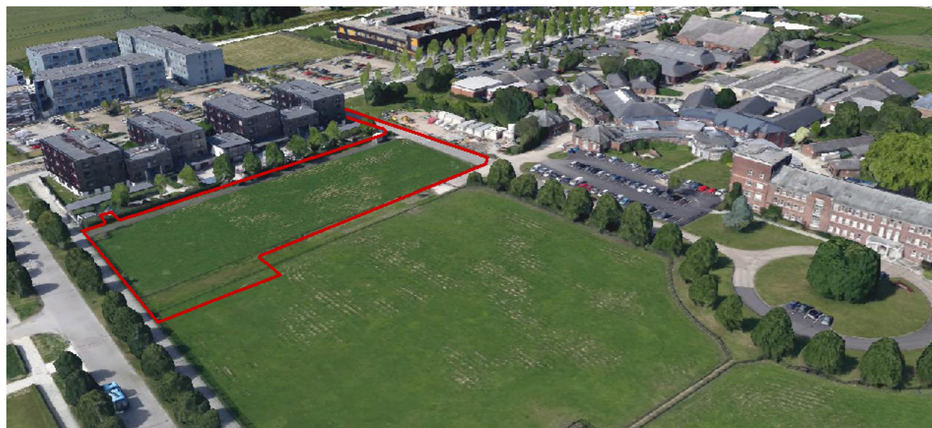
Aerial view of the existing paddock with the site highlighted in red