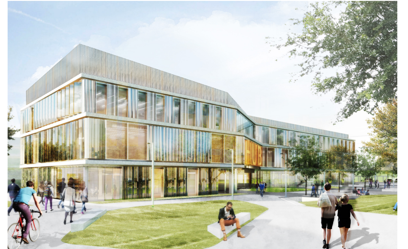
Visual of building approaching from the north along J.J. Thomson Avenue