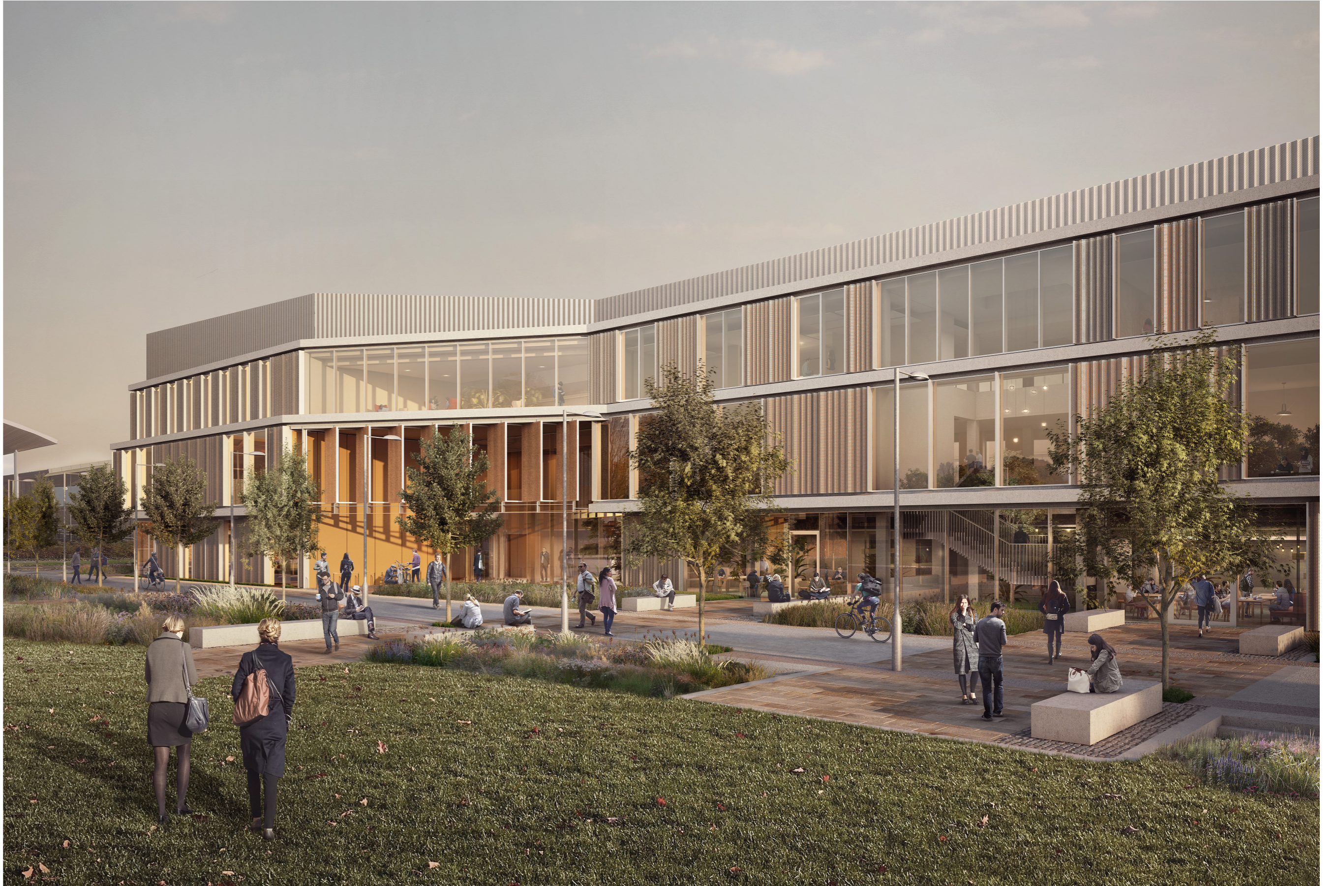
View of the new Hub building from J.J. Thomson Gardens

Through the new Masterplan the University have committed to enhancing the community on West Cambridge. This proposal is for the first of the planned 'Hubs' on the site, representing a new model for the delivery of amenities and facilities, whereby these are not provided internally within academic departments or commercial occupiers, but are delivered as a shared resource, which is available for use by all site users, including residents and the general public. It is the aim that these new 'hubs' bring vibrancy and a sense of place to the West Cambridge Site.