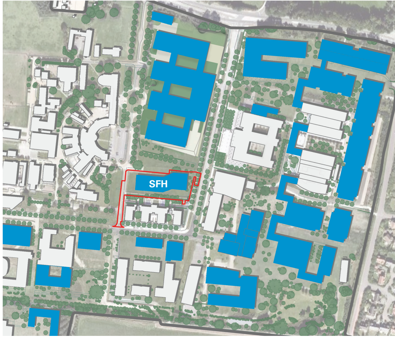
Site Masterplan showing the location of the new Shared Facilities Hub