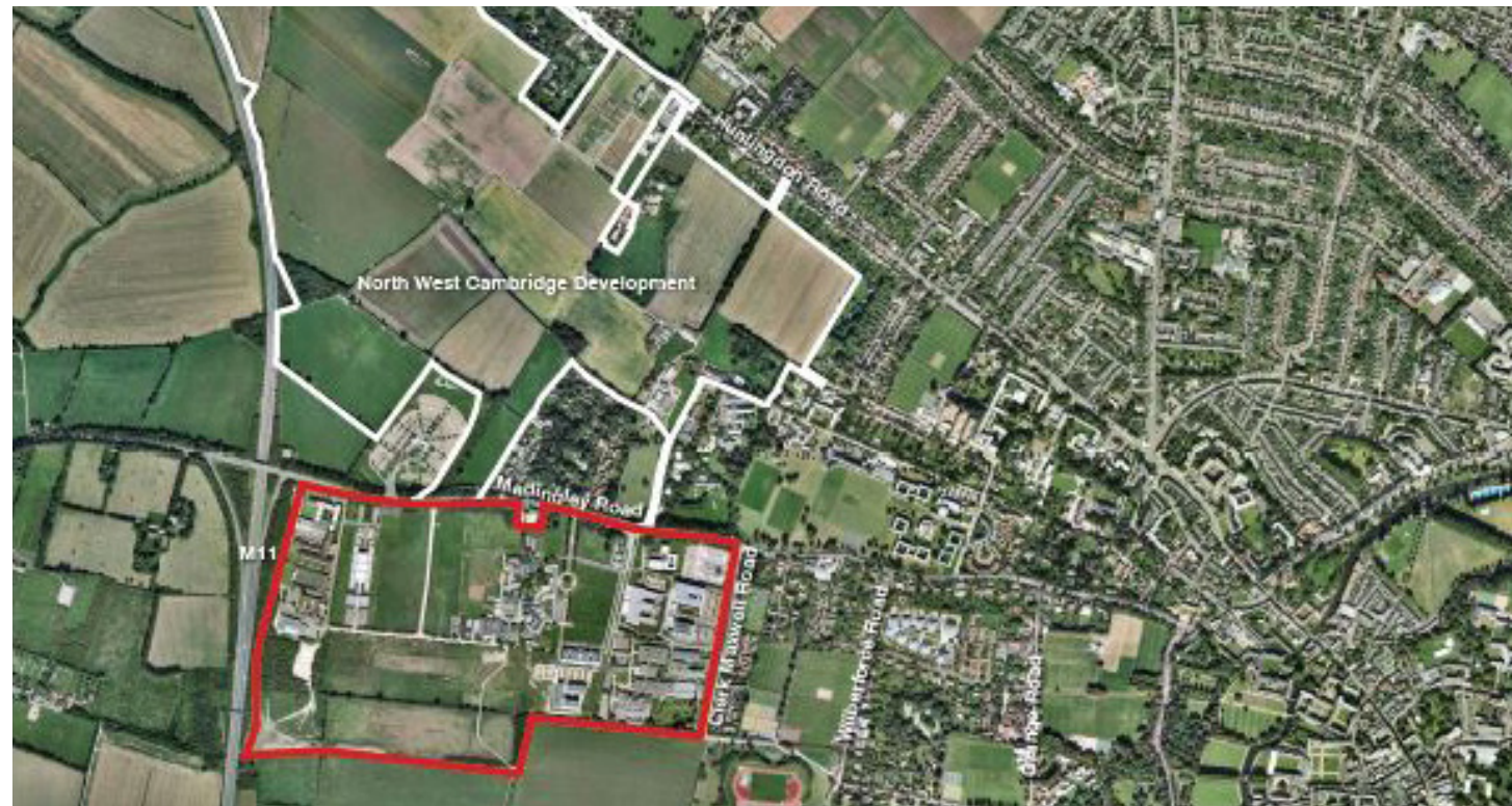
01. The West Cambridge site shown in relation to North West Cambridge Development and Cambridge city centre

0.2.4 Development parameters and masterplan principles set a robust framework for the development and form part of this Design and Access Statement. A finer grain of definition is provided through the Design Guidelines document.