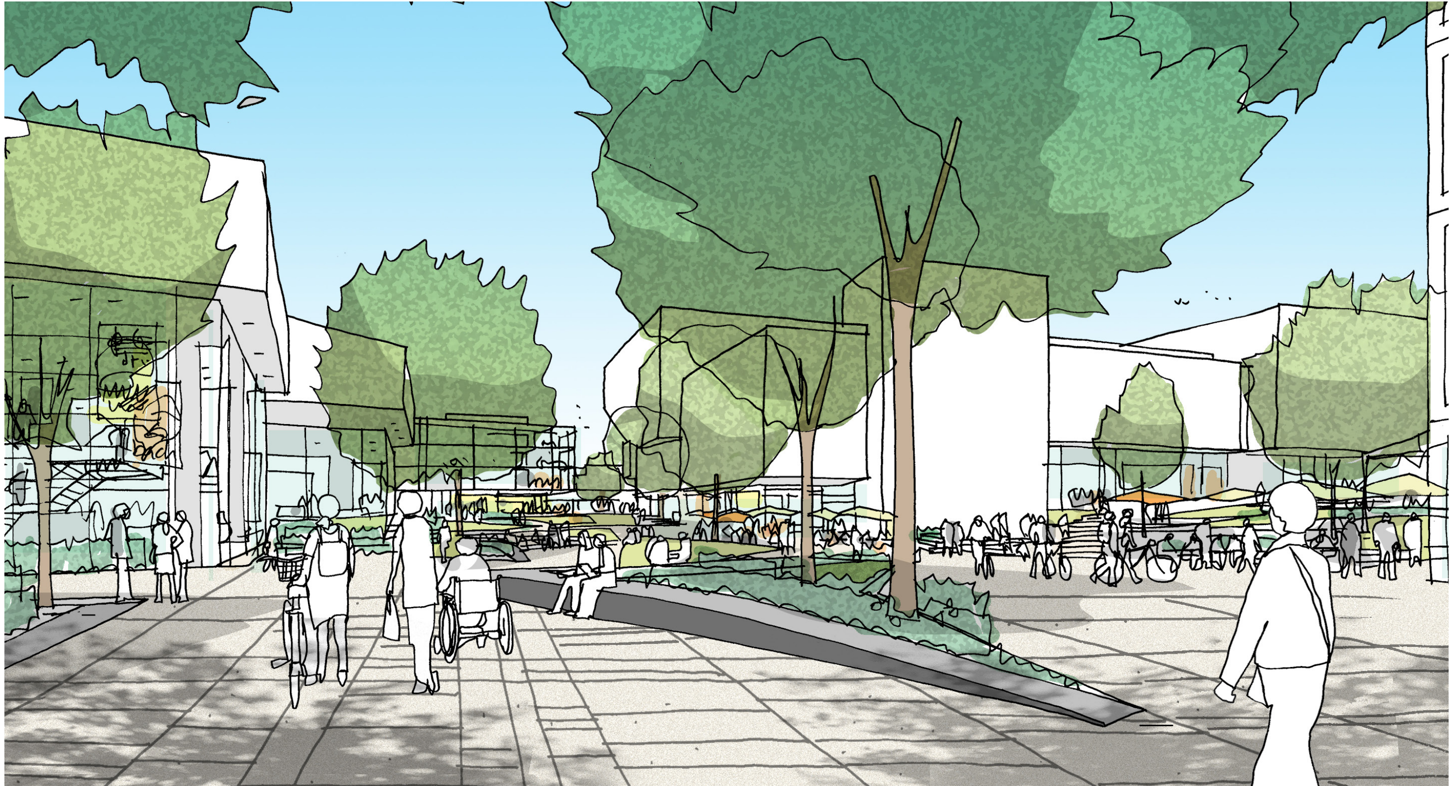
02. West Cambridge Illustrative Masterplan - view of the East Forum